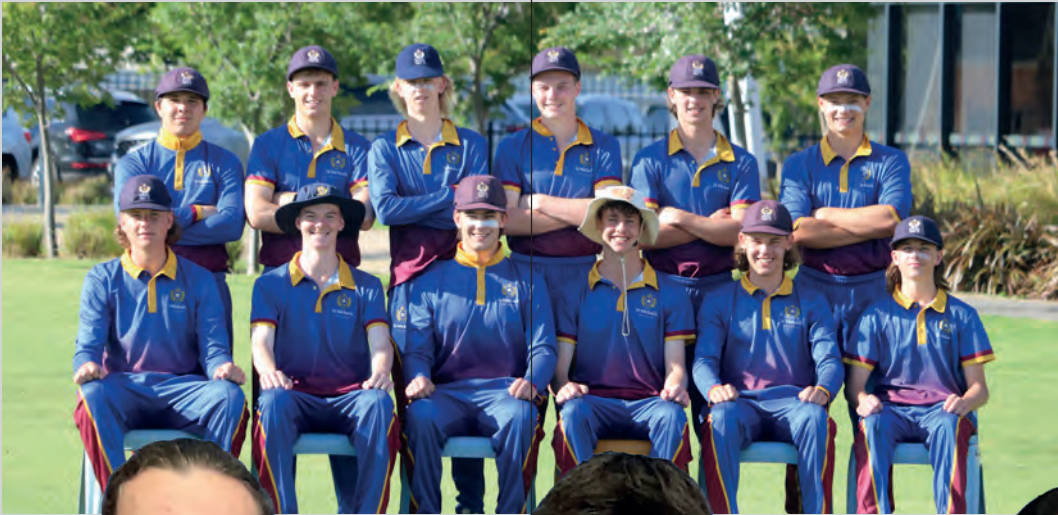
First XI T20 Cricket

Our 1 st XI Cricket team had an incredibly successful Term 4 season, going undefeated through both the Friday T20 and Saturday afternoon competitions. The 1 st XI T20 Cricket team made it through to the Grand Final won.