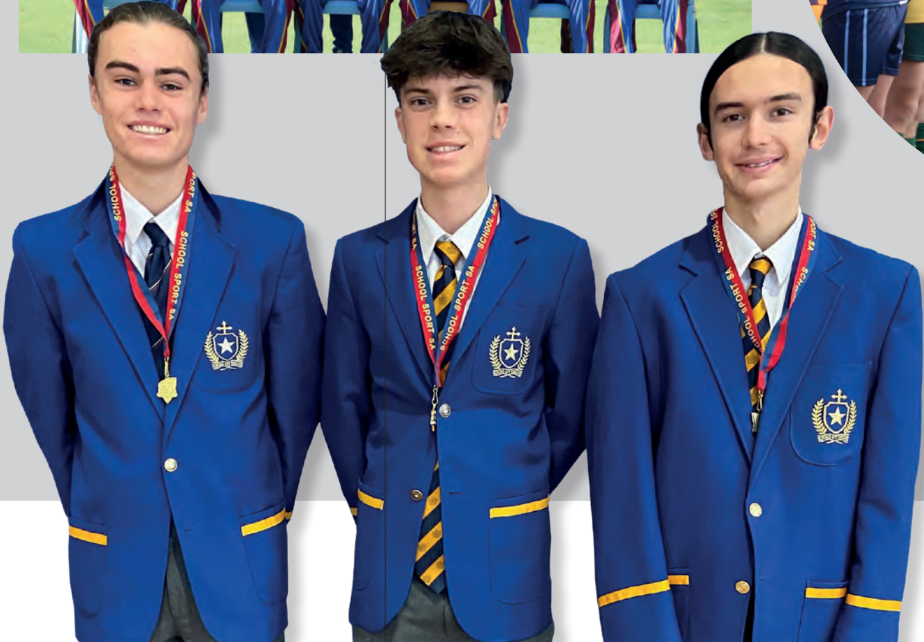
Cross Country Open Boys