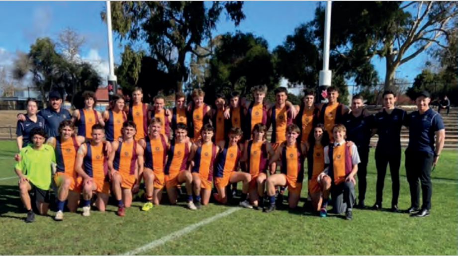
First XVIII Football

The First XVIII Football had an outstanding year going undefeated throughout the season. Making their first Grand Final in several years, which is a fantastic achievement, the boys unfortunately just went down to Sacred Heart College in the decider.