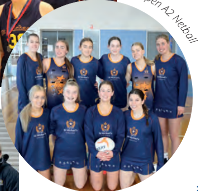
Open A2 Netball

Our combined Year 9/10 Girls Knockout Basketball team played a fantastic tournament and won through to the Grand Final against Immanuel College but went down by 1 point in a nail biting finish, ending State runners up.