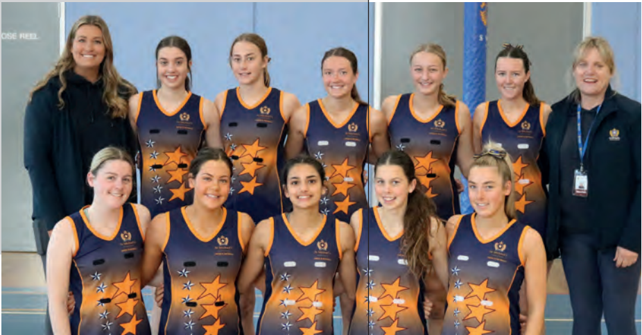
Open A1 Netball