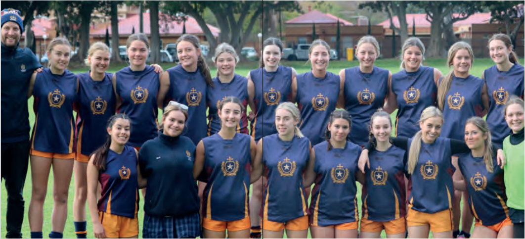
First XVIII Football

The First XVIII Football team had another outstanding year as we introduced a 16 a-side team to the SACSSGSA weekly competition. They defeated Sacred Heart in the weekly Grand Final. They also, for a third year in a row, played in the Statewide Open Girls Knockout Grand Final at Thebarton, but unfortunately went down to a very strong Scotch College.