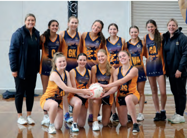
Girls 9/10 Netball